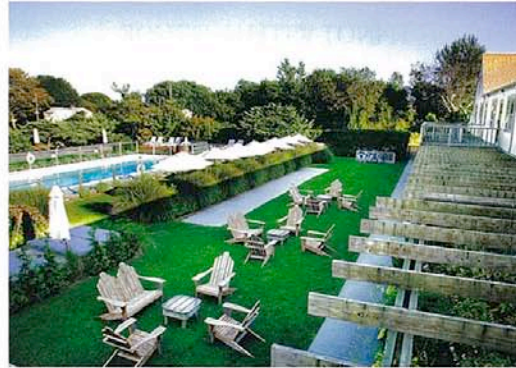
Backyard at Sole East