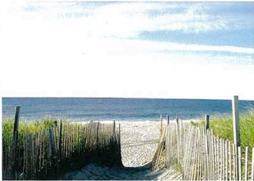
Main Beach, East Hampton