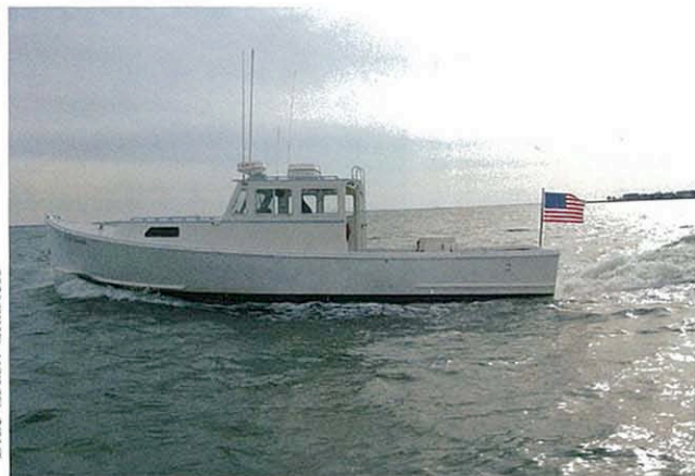
Blue Crush Charters

I decided to rough it instead. A quick drive over to Wines by Morrell rewarded me with a nice crisp Chardonnay, a perfect pairing for a Clambake to Go from local caterer Claws on Wheels. The end result? Loads of tasty clams, lobster, mussels, corn, and new potatoes to feast on. Just perfect.