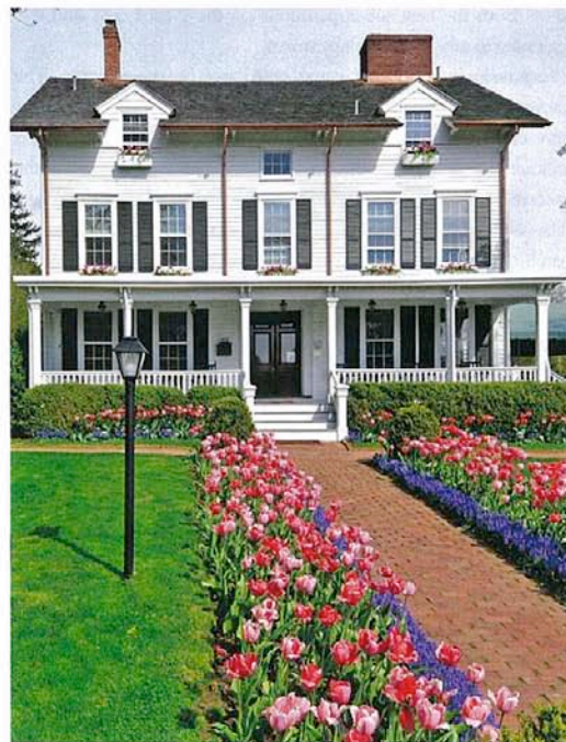
The Hedges Inn

Immersed in this sun, sand, and fun, it was hard to tear myself away from here, so rather than dressing for lunch,